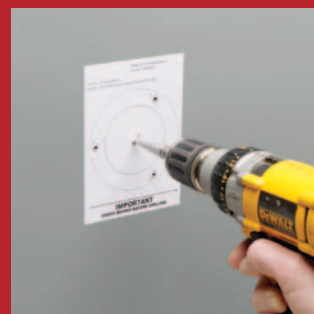
Position with template