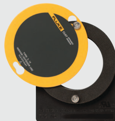
Fluke CLKT IR Window for outdoor/indoor applications—50 ka arc-tested