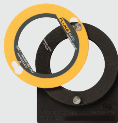
Fluke CLKTO IR Window for indoor medium voltage applications up to 38 kV