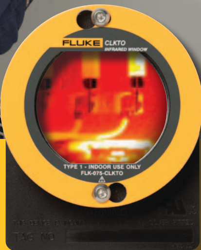
Indoor medium voltage