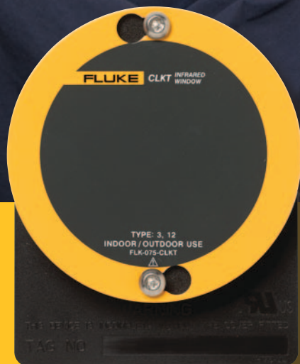
Outdoor/indoor any voltage, arc-tested