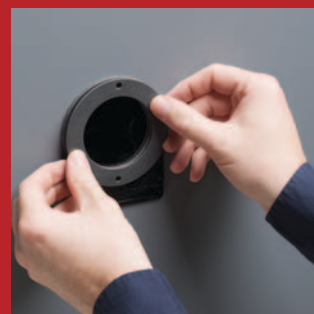
Affix the window

For detailed installation see the UL validated installation instructions supplied with each IR Window.