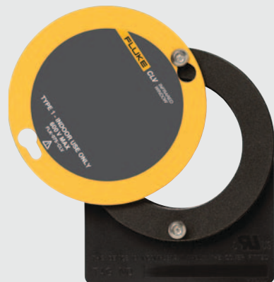
Fluke CLV IR Window for indoor low voltage applications up to 600 V