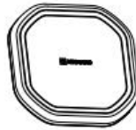
MIC protective case (X1)