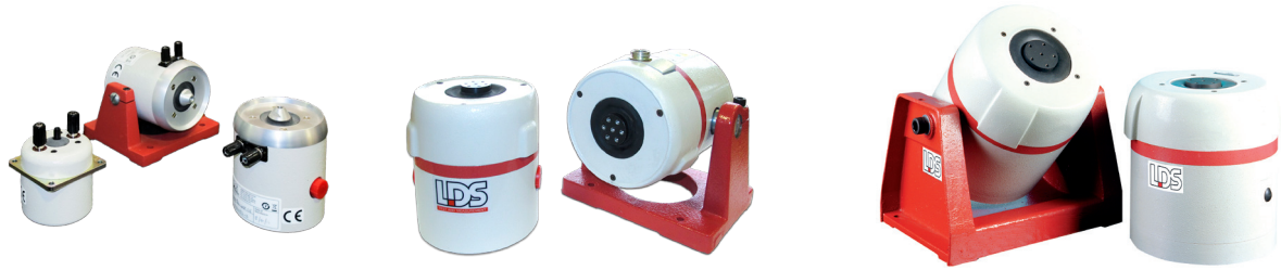
left to right: V100 Series, V200 Series on trunnions, V200 Series, V400 Series, V400 Series on trunnions, V450 Series on trunnions, V450 Series