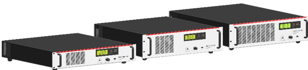
left to right: LPA100 Amplifier, LPA600 Amplifier, LPA1000 Amplifier