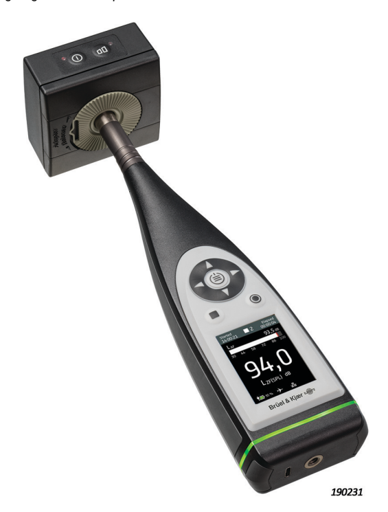
Fig. 2 Type 4231 fitted on the B&K 2245 Sound Level Meter microphone. The calibrator's centre of gravity is positioned very close to the microphone, giving a stable setup

The calibrator gives a continuous sound pressure level when fitted on a microphone and activated.