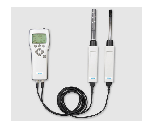
The two ports of MI70 allow measuring CO_2 and RH/T_d simultaneously

The meter can also be used as a calibration check instrument for Vaisala's fixed \mathrm{CO}_2 instruments. GMW90 and GMP220 probes can also be adjusted by using the GM70 meter. GM70 has two probe inputs. Vaisala's relative humidity and dew point probes can also be used simultaneously with \mathrm{CO}_2 measurement.