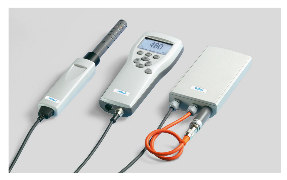
The Vaisala CARBOCAP® Handheld Carbon Dioxide Meter GM70 is the demanding professional's choice for handheld carbon dioxide measurement. The meter consists of the indicator (center) and probe, used either with the handle (left) or pump (right).