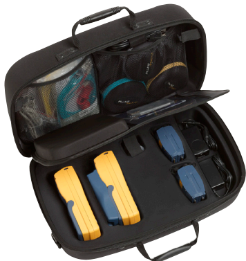
DTX Compact OTDR Kit