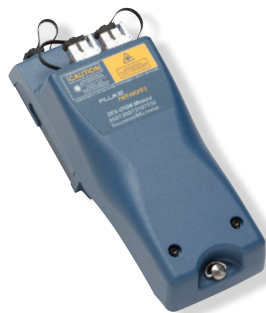
DTX Compact OTDR module